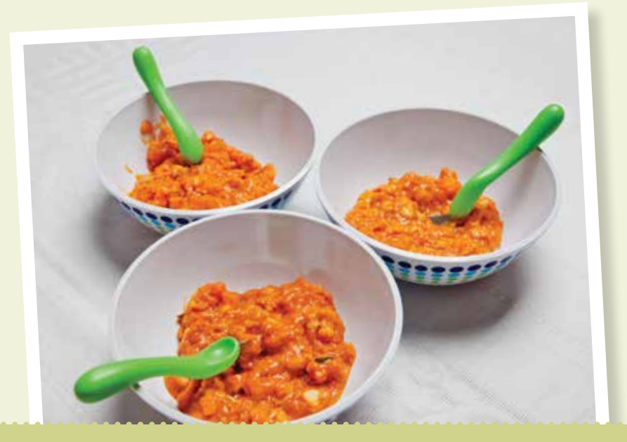
Note: To prevent botulism, do not feed honey to infants aged under 12 months